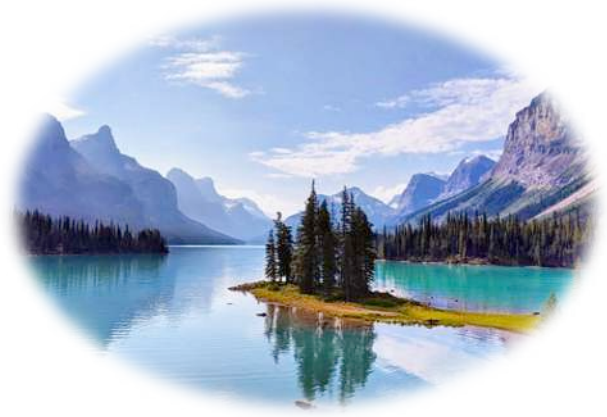
Spirit Island Maligne Lake

“Can the quiet serve some constructive purpose living a better life? There’s refuge inhabiting even for a few moments — a calm, grateful, embodied present.