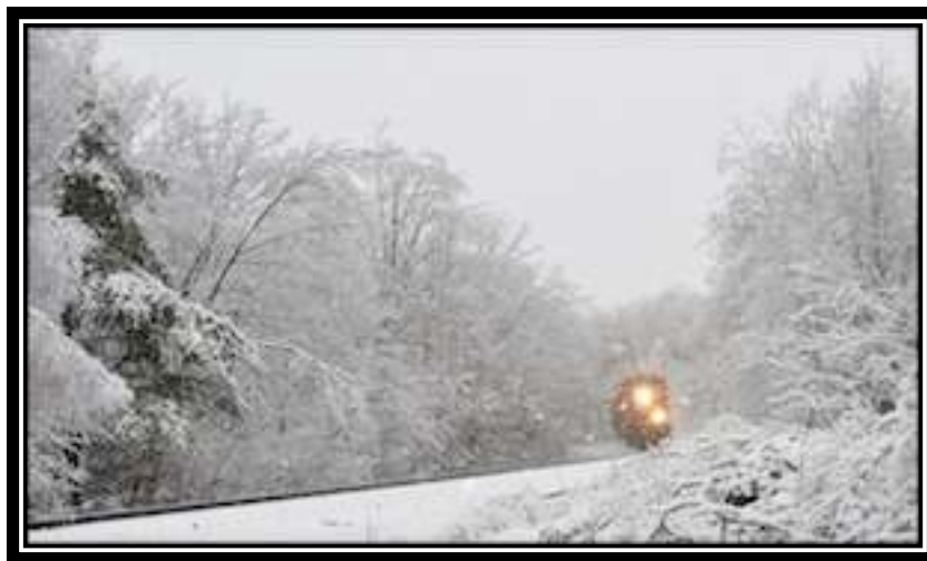
Freight train along the Glen Tay-Havelock route.