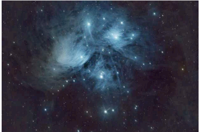
~ Pleiades Cluster ~