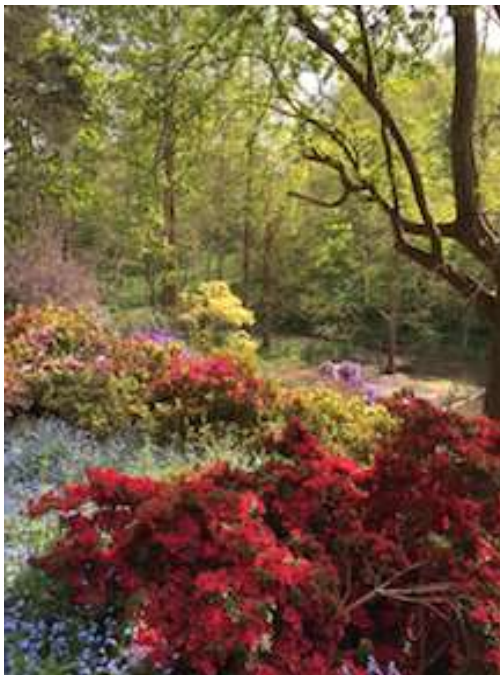
Photo courtesy a friend visiting family in London, England, April 2022

May is also resplendent with the gentle fragrance of lilacs and the lush beauty of Mulberry trees. How lovely it is to see gardens with delightful tulips in full bloom displaying their brilliant multi-colours. Oh, yes, must not forget about the 'thousands-upon-thousands' of 'dandelions!'