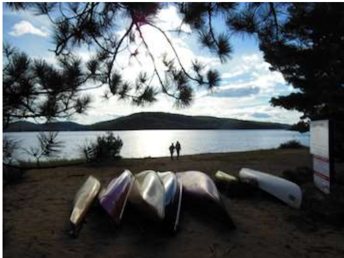
Algonquin Park