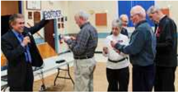
"US Militia" stopping at the border.