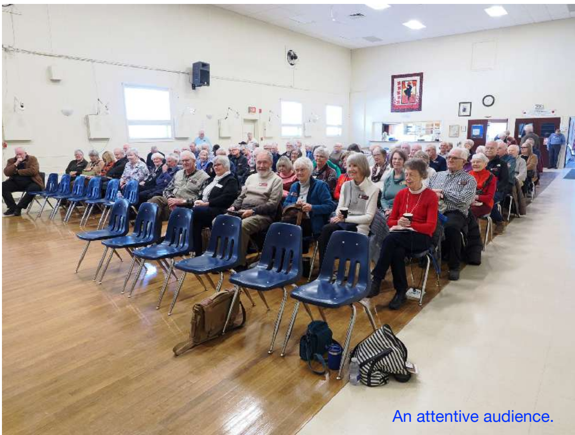
An attentive audience.