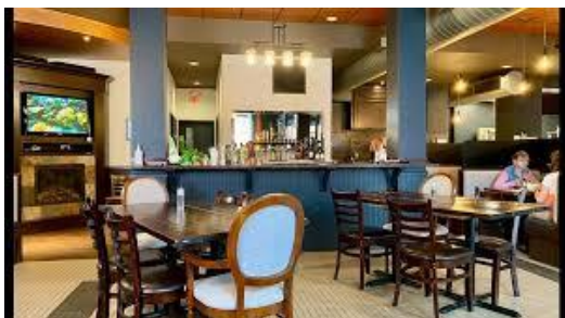
The Vault Restaurant 5 pm

Dinner and Theatre An evening in Smiths Falls