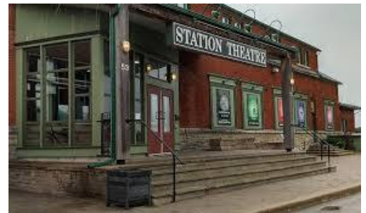
Station Theatre 7:15 pm

Sign-up with Linda at bl.walker@sympatico.ca by Monday, October 13 th to make your reservation at The Vault and purchase your theatre ticket at just $21! Maximum 20 participants.