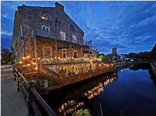
Mex & Co

Wine and Wander (Around the World) A great evening was had on October 8 th as our progressive dinner took us to three lovely restaurants where we enjoyed great service, delicious food, and lots of laughs and fun!