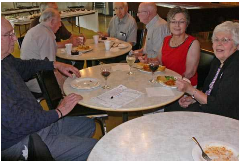
At the June Lunch