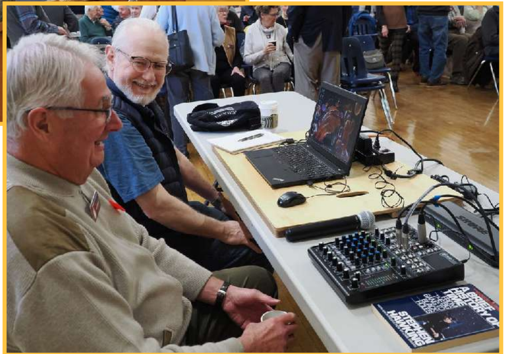
Our expert Audio Team